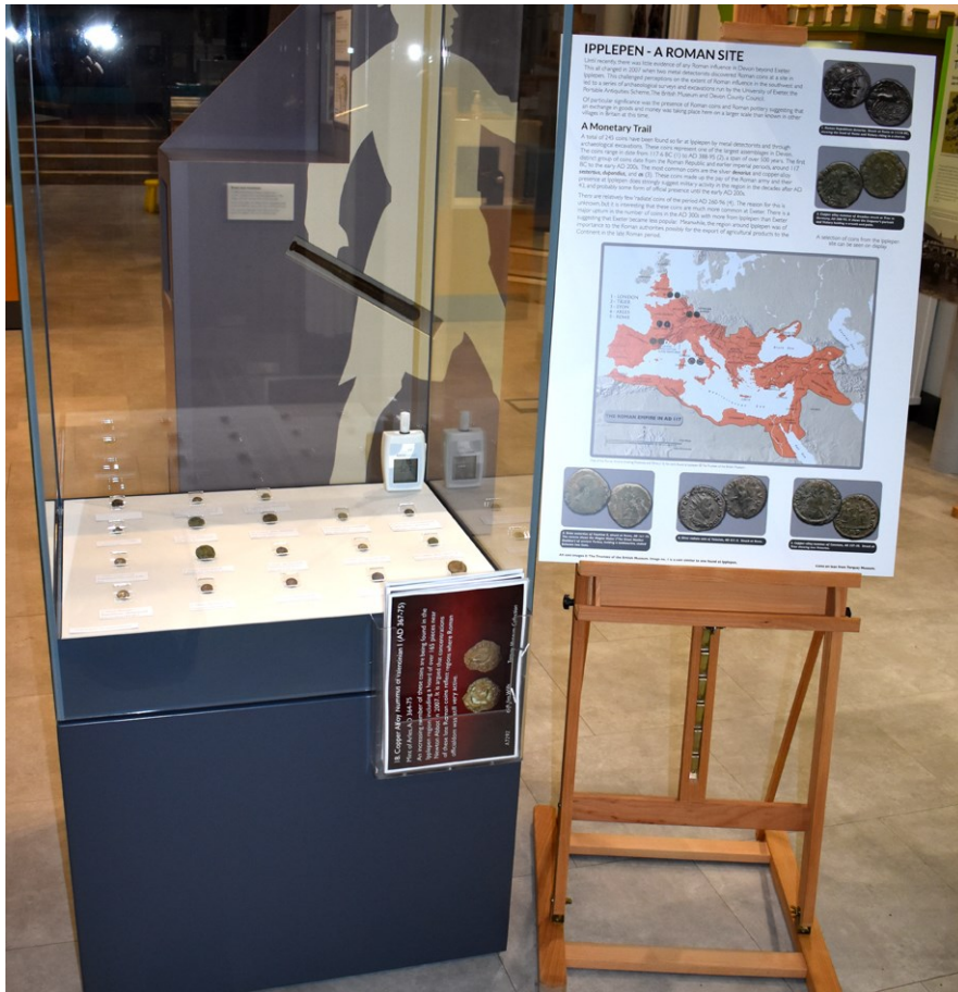
Some of our exhibits change occasionally, like the Object of the Month by the front desk.